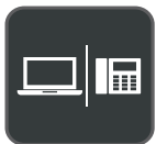
Multiple Devices Connection