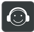
All Day Wearing Comfort