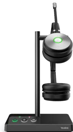
WH62 Dual Teams WH62 Dual UC

Based on hundreds of headform evaluations and thousands of wearing comfort tests, WH62 well meets the ergonomic requirements. Besides, with premier soft leather cushions and lightweight design, you can wear it all day comfortably. For more workspace freedom, WH62 can also free you up to 160m away from the desk.