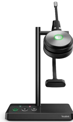
WH62 Mono Teams WH62 Mono UC