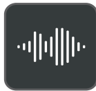
Optima Audio Experience